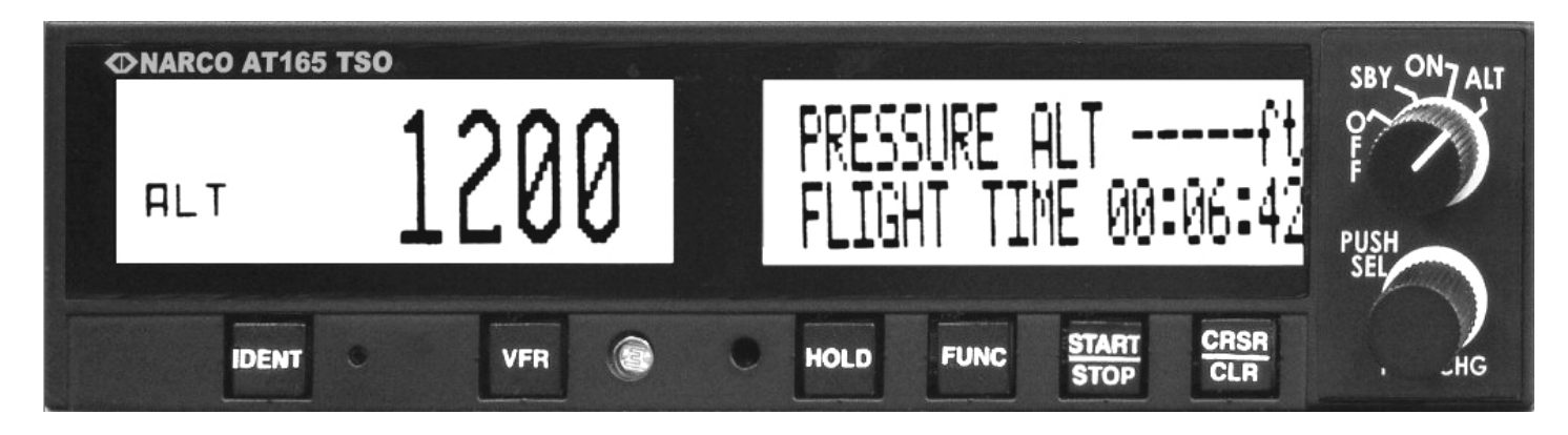
FIGURE 1-1 AT 165 FRONT PANEL