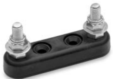
Fuseblock - 4164

The only controlled copy of this Data Sheet is the electronic read-only version located on the Bussmann Network Drive. All other copies of this document are by definition uncontrolled. This bulletin is intended to clearly present comprehensive product data and provide technical information that will help the end user with design applications. Bussmann reserves the right, without notice, to change design or construction of any products and to discontinue or limit distribution of any products. Bussmann also reserves the right to change or update, without notice, any technical information contained in this bulletin. Once a product has been selected, it should be tested by the user in all possible applications.